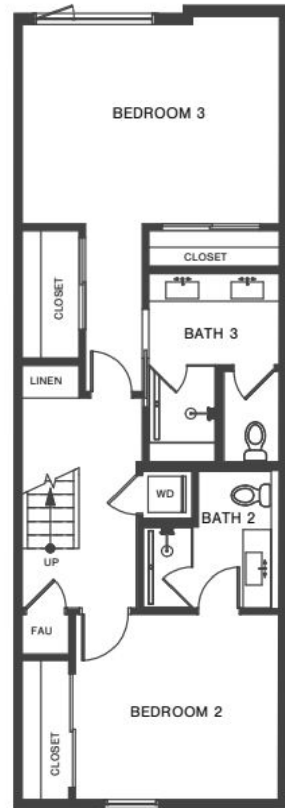
SECOND LEVEL DOWN