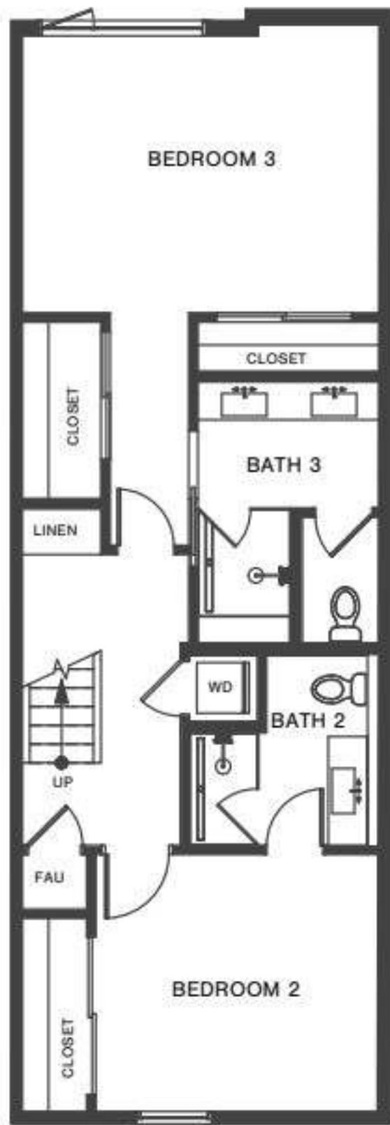
SECOND LEVEL DOWN